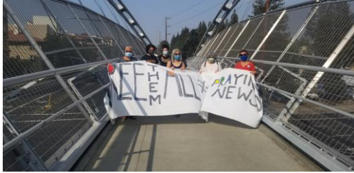
UUs at a #FreeThemAll Banner Drop in downtown Walnut Creek