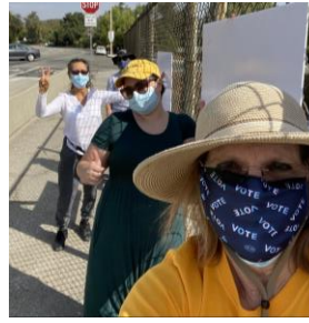
UUs at a #FreeThemAll Banner Drop in Westlake