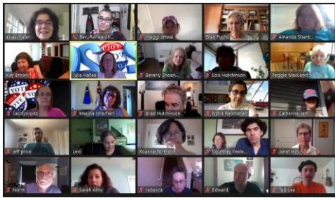
UUJMCA's "From Worship to Work" Sunday Phonebanks with Reclaim Our Vote

And in these last few months, UUJMCAs UU the Vote ministries have continued. Every Sunday in September and October, UUJMCA partnered with Reclaim Our Vote to run phonebanks to voters in states with a history of voter suppression, making thousands of calls. As part of interfaith coalitions, UUJMCA has supported efforts to ensure that every vote is held sacred, including actions targeting the Jones Day Law Firm's California offices.