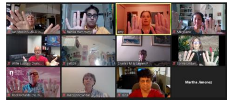
Participants of a "Free Them All" Community Action Circle bless each other

As part of our mission to ensure California UUs had access to and engaged in opportunities to create justice while staying as safe as possible, your UUJMCA worked alongside partners to generate several forms of online justice-making ministries. Adapting a model shared by the Unitarian Universalist Service Committee, UUJMCA's Immigrant Justice Action Team hosted several "Free Them All" Community Action Circles , bringing together groups online to participate in a spiritually-rooted hour of reflection and action - making calls, signing petitions, sending emails, and advocating for immigrant justice in California and beyond.